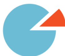
Shareholder Proposals – Votes versus Management